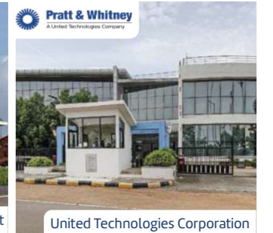
United Technologies Corporation