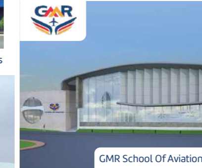
GMR School Of Aviation