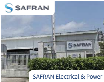
SAFRAN Electrical & Power