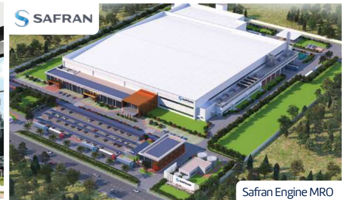
Safran Engine MRO