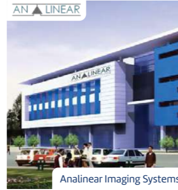
Analinear Imaging Systems