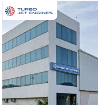
Turbo Jet Engines