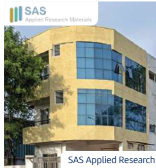
SAS Applied Research