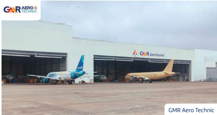
GMR Aero Technic